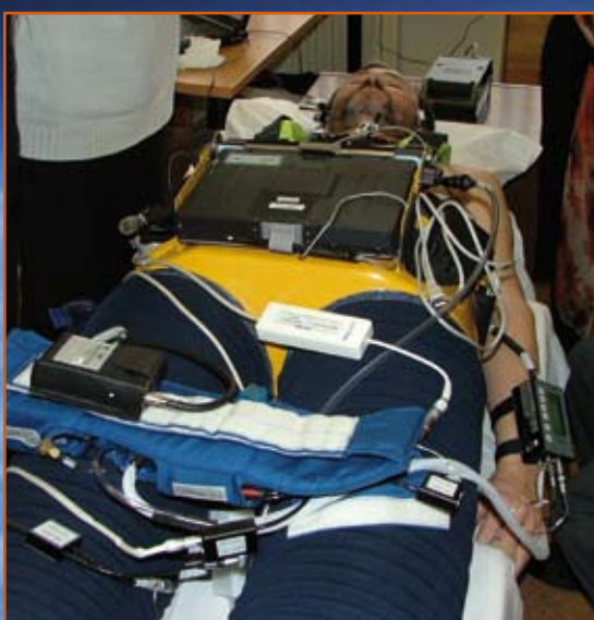
LBNP (Lower Body Negative Pressure) Test with Chibis suit

Space flight induces a cardiovascular deconditioning syndrome and requires cardiovascular monitoring during the mission and after return to earth. One of the most serious symptoms of cardiovascular deconditioning is represented by a decrease in orthostatic tolerance, along with a significantly reduced capacity for exercise and an increase of heart rate. The Cardiomed system (CNES-IMBP cooperation) records and analyses, in a non invasive way, the main cardiovascular parameters for medical monitoring and physiological studies.